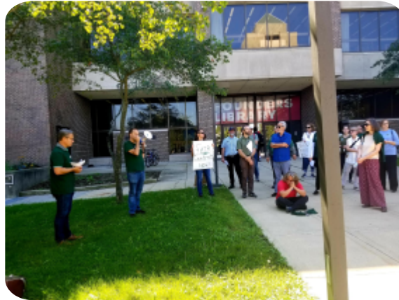
UFA and AFSCME Local 1890 members protest in front of Founders Library.

Solidarity is our power. We have a voice, and we can use that voice to affect the change we need.