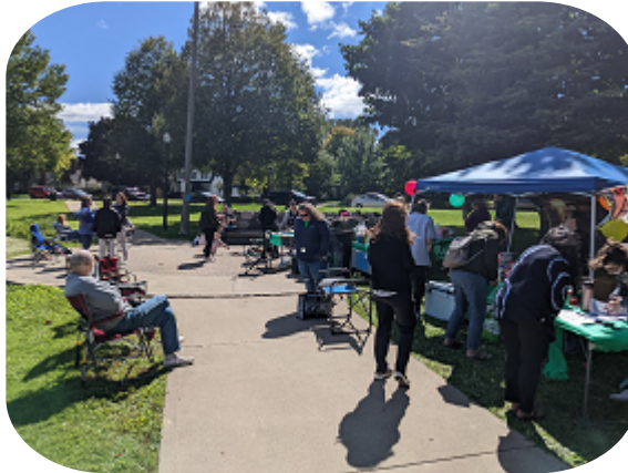
Attendance was great due to perfect weather at the NIU East Lagoon and Firepit.