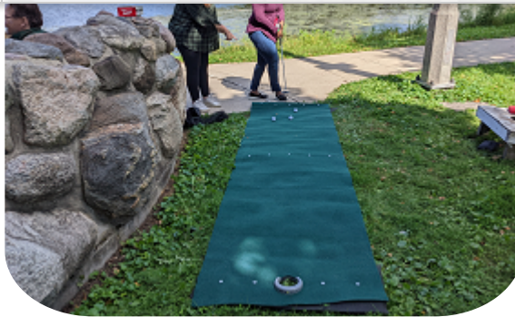
Party-goers played games of skill to earn extra raffle tickets.