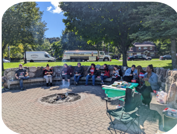
A terrific time was had by all!