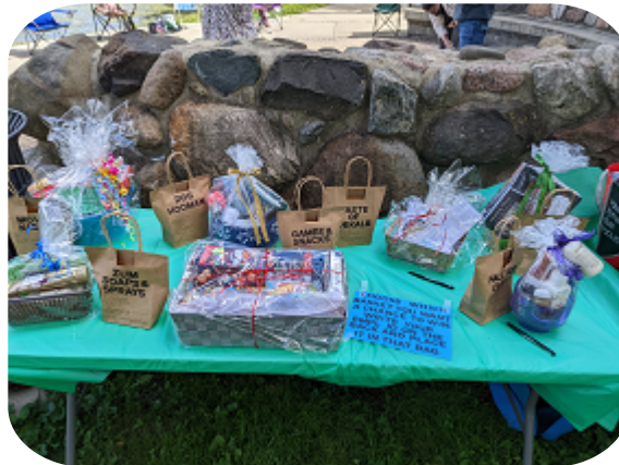
The 1890 party planning committee donated fabulous prizes for members to win!

See all the photos and a complete list of prizes and winners at our website AFSCMELocal1890NIU.com.